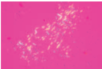
Crystals of Gout

Collected fluid should immediately be placed into appropriate containers and analyzed expeditiously. Check with your laboratory regarding specific submission procedures (e.g., the correct tubes and the volume of fluid required for each test) at your institution. If only minute volumes of synovial fluid are obtained, discussions with laboratory personnel are indicated to prioritize testing. As little as one drop of fluid may be sufficient for crystal analysis, and 1 ml may suffice for a cell count and a differential count. 4